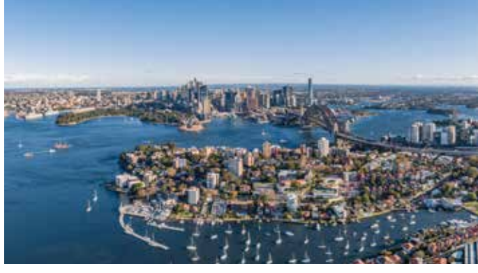
The 2012 choice: mediocre Sydney ....

What does the investor do? Her decision will impact on her financial future.