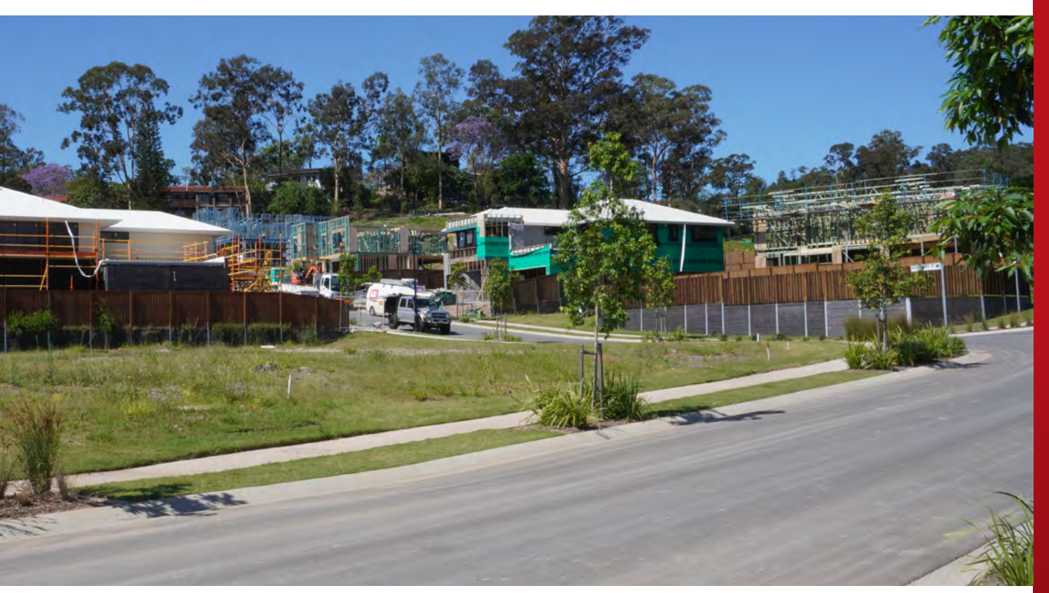
New homes in Oxley Priority Development Area

Social and affordable housing is a vital part of our housing system. Queensland is lucky to enjoy a vibrant Community Housing sector which delivers essential housing services to thousands of Queenslanders each day. A continuing long-term commitment to, and investment in, social and affordable housing, including government and community housing providers, is key to ensuring a single healthy housing system overall.