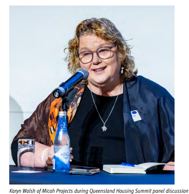
Because of its attractiveness as a place to live,

Like many places in Australia and overseas, Queensland's housing system is experiencing significant pressures. Following the global pandemic, the way we live has changed. Globally, working from home has increased demand for more space in different locations. Queensland, like other jurisdictions in Australia, is not immune to these changes.