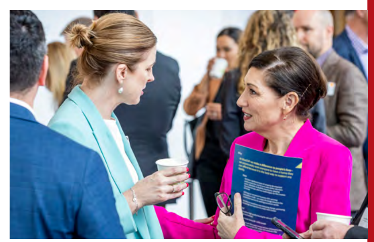
The Honourable Leeanne Enoch MP, Minister for Communities and Housing, Minister for Digital Economy and Minister for the Arts speaks with the Honourable Julie Collins MP, Federal Minister for Housing, Minister for Homelessness and Minister for Small Busines at the Queensland Housing Summit

No one solution can solve this complex problem. Accordingly, this report sets out a range of actions directed towards activating the right solution at the right time. To address