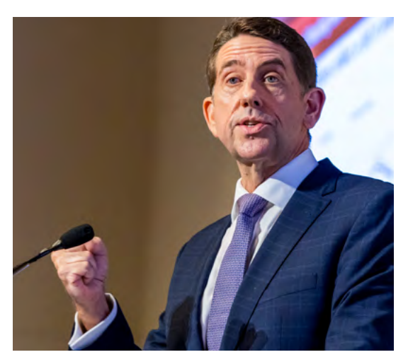
The Honourable Cameron Dick MP, Treasurer and Minister for Trade and Investment at Queensland Housing Summit

the flagship Housing Investment Fund, recently doubled to $2 billion in value – returns of up to $130 million a year will now be available to support