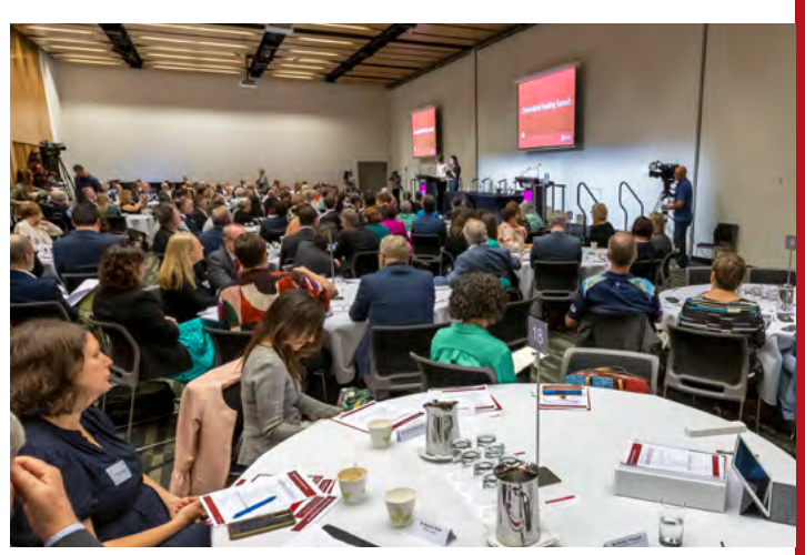
Housing Summit attendees participating to support housing outcomes for Queenslanders

opening address by the Honourable Annastacia Palaszczuk MP, Premier and Minister for the Olympics