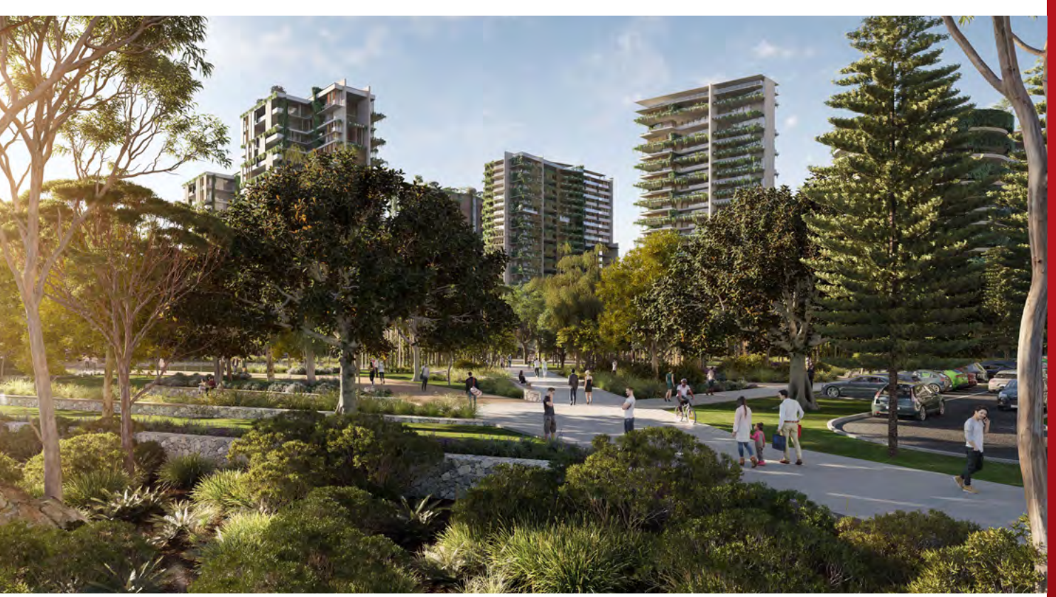
Artist render of Northshore Hamilton Priority Development Area

The Queensland Government will also reconvene the Housing Roundtable in March 2023. The purpose of these meetings will be to gain insights into the health of the housing system and report against implementation commitments.