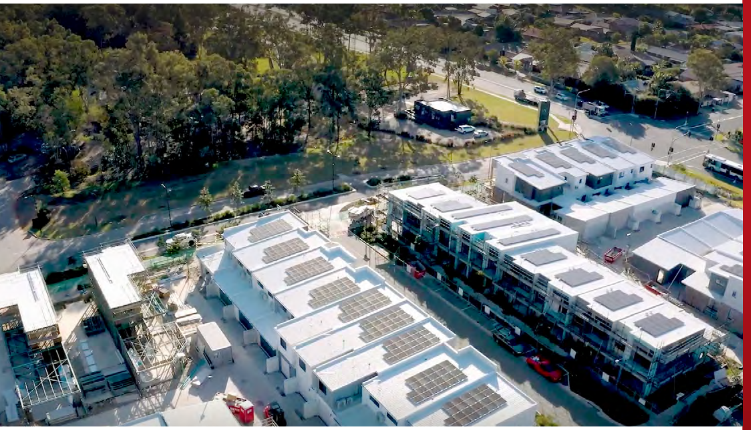
Carseldine Village in the Fitzgibbon Priority Development Area