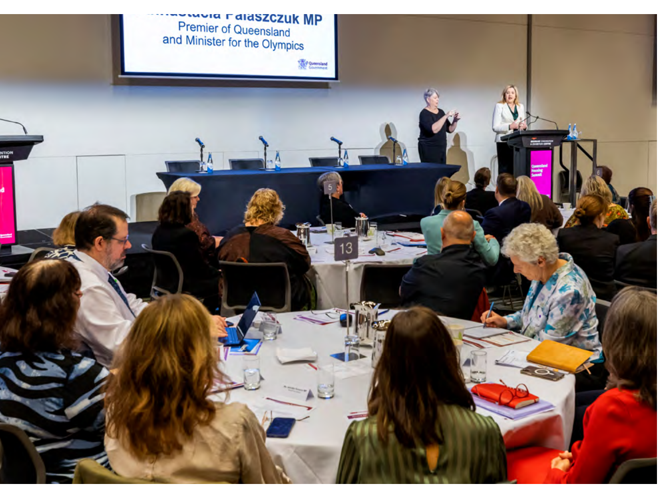
The Honourable Annastacia Palaszczuk MP, Premier and Minister for the Olympics addresses Queensland Housing Summit

The following tables set out the actions that will be undertaken to deliver on the Summit.